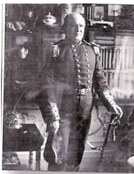
Royal Navy Reserve, c.1908